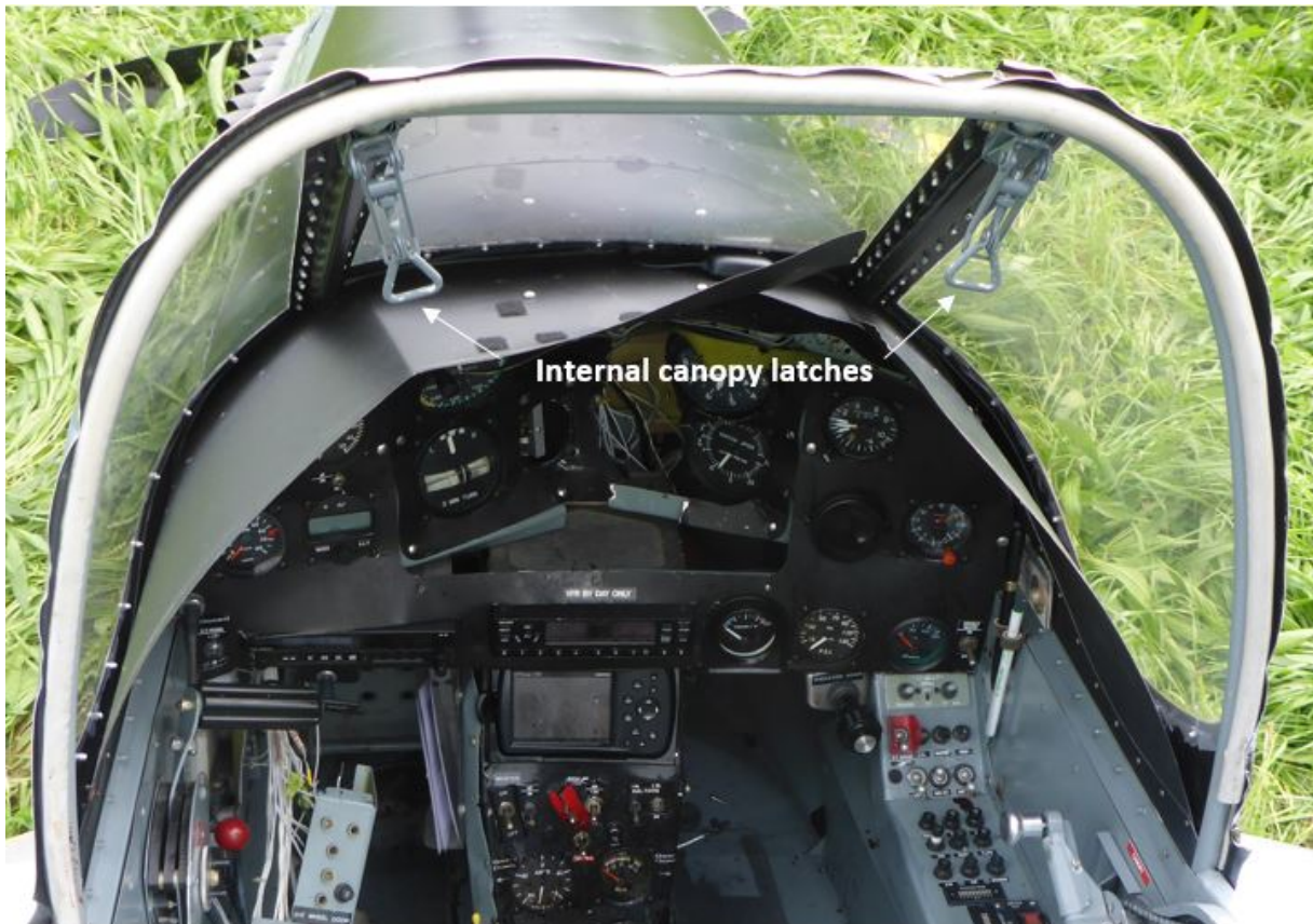
Figure 5: internal canopy latches installed by the pilot