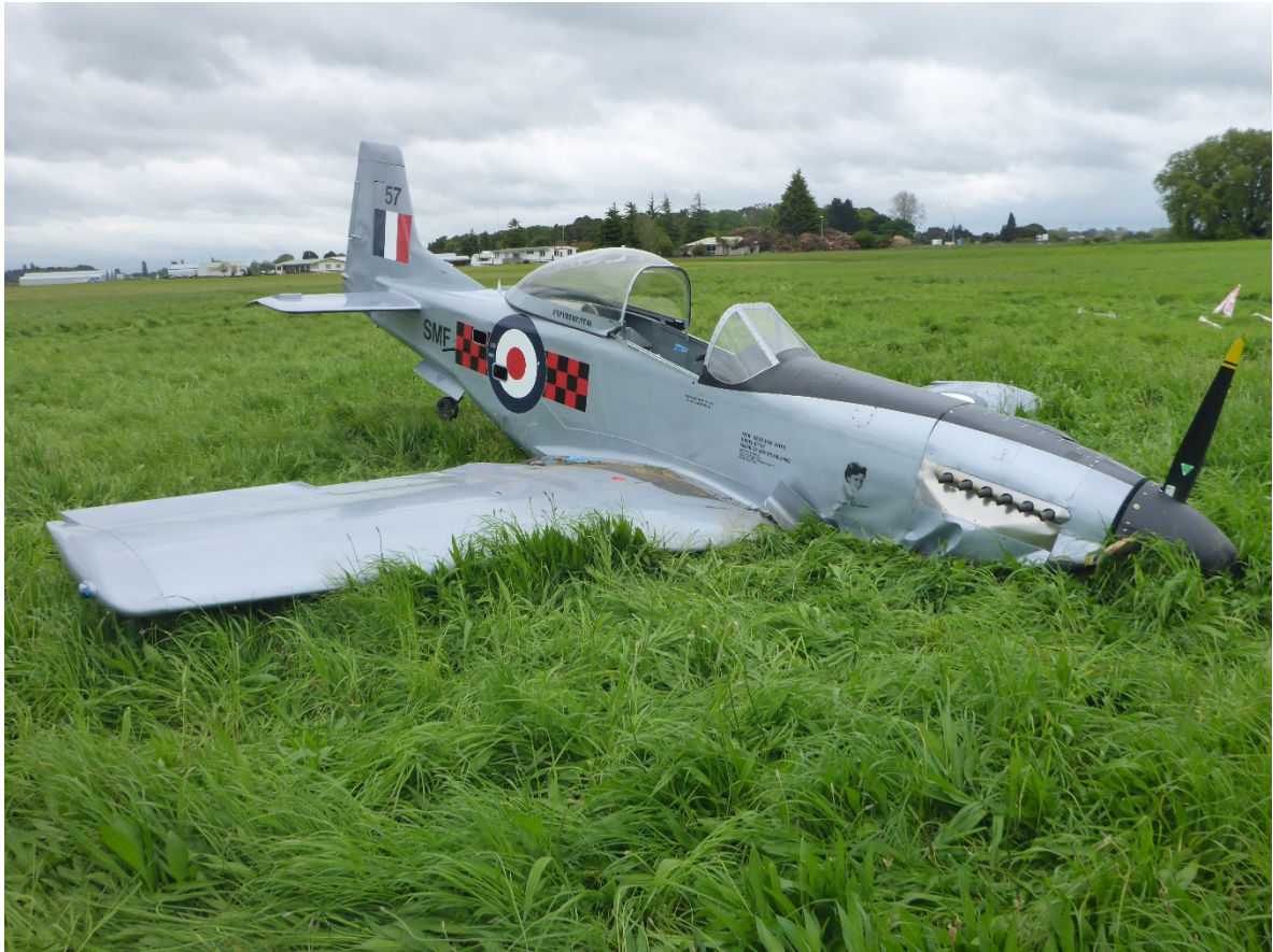
Figure 3: Accident site