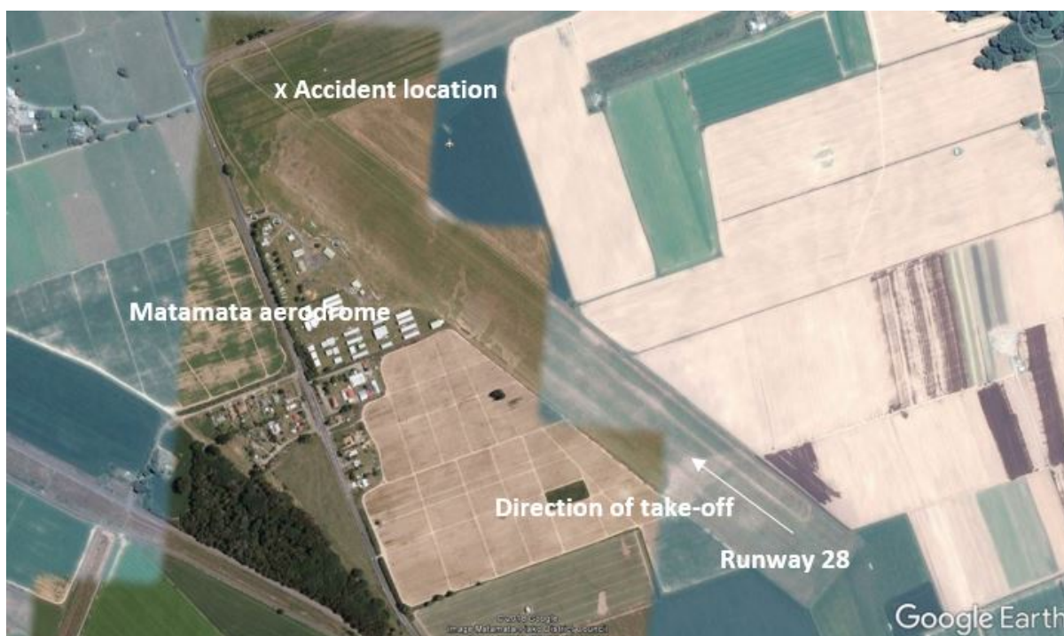
Figure 2: Accident location