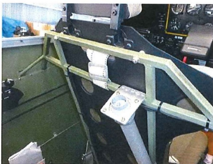
Shoulder harness attachment – correct position.

The seatback frame on these aircraft has two horizontal bars, an upper and a lower bar. Examination of the pilot seat revealed that the shoulder harness was attached to the upper bar of the seatback frame.