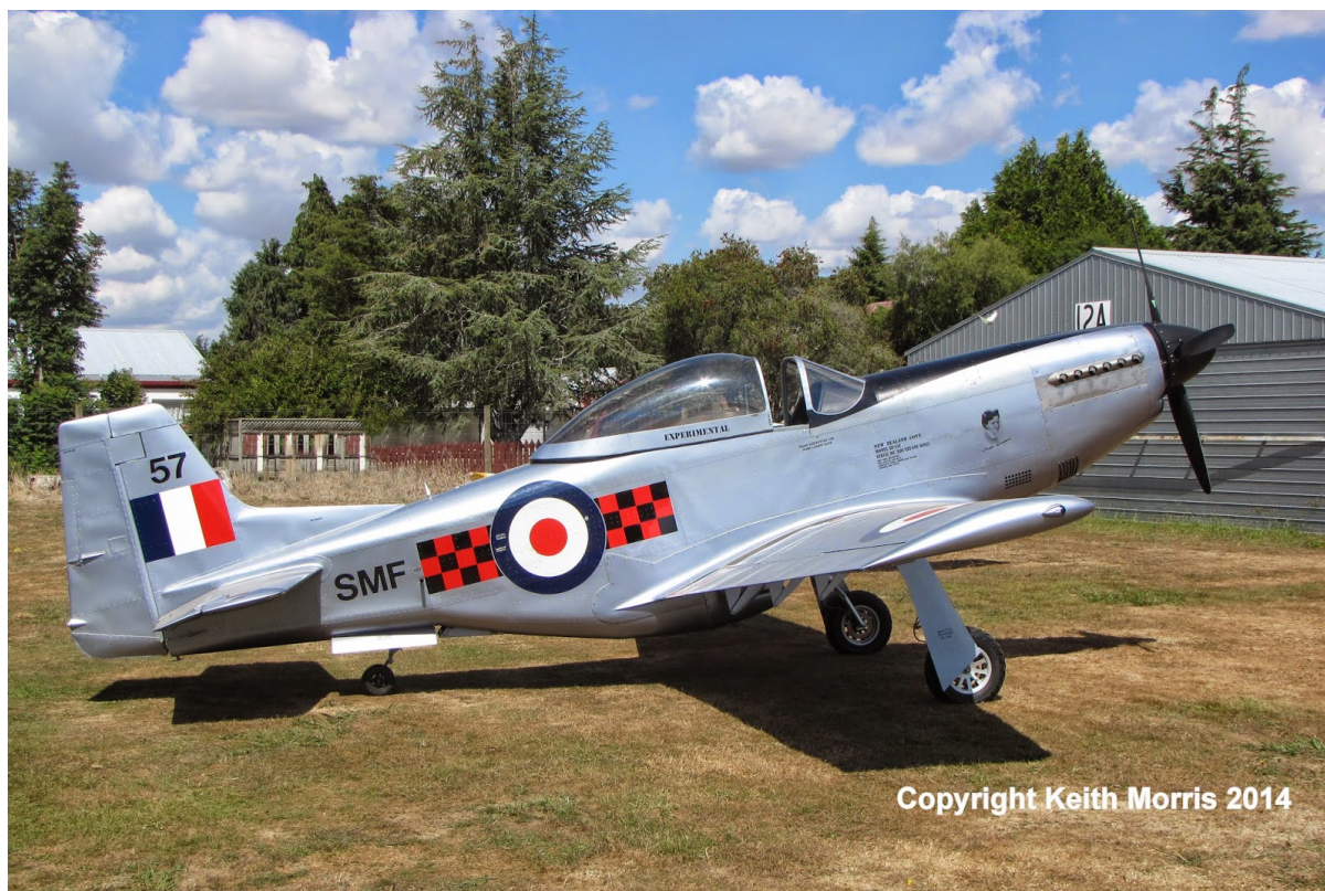
Figure 1: ZK-SMF