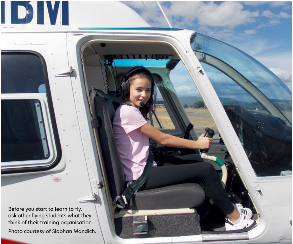
Before you start to learn to fly, ask other flying students what they think of their training organisation.

Make sure you record every flight. You'll have your very own pilot logbook to record the date of each flight and lesson, the aircraft type and registration (the letters on the back of the aircraft), the name of your instructor, the length of your flight, where you went and what you did.