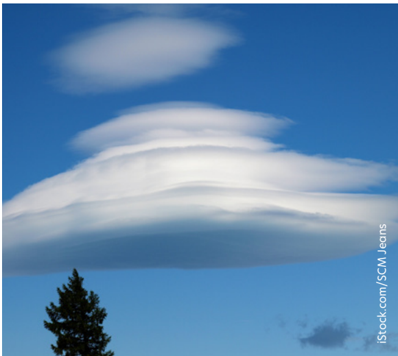
As a trainee pilot, you'll learn about New Zealand's weather patterns and cloud formations. This is an example of a lenticular cloud.

If you're going to fly, you have to know the rules for safe flying. For example, one of the rules is that you have to have a flight review every two years to be able to keep using your licence. This is part of what's called 'air law', and there's an exam on it that you have to pass, before you get your licence the first time.