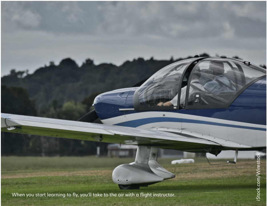
When you start learning to fly, you'll take to the air with a flight instructor.

If you want to continue to learn after that first flight, it usually takes between 10 and 20 hours of flying, learning the basics with an instructor, before you can 'go solo' - that means your first flight on your own as the pilot-in-command. You have to be 16 years old to go solo.