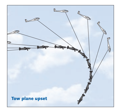
The glider kites rapidly after a pitch-up displacement as it runs out of elevator authority.

The GNZ Manual of Approved Procedures and the associated GNZ Manual of Glider