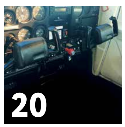
// DUAL CONTROLS - WHO CAN CHANGE THEM