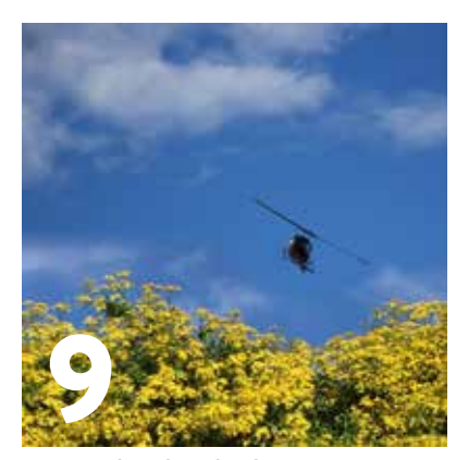
// A BLACK BOX FOR GA