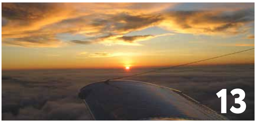
// TO HELL AND BACK - A PILOT'S JOURNEY TO REGAIN MENTAL HEALTH