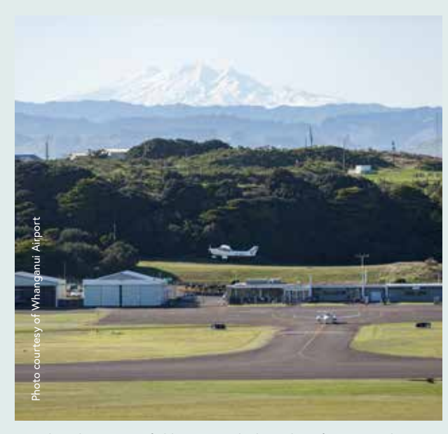
// The Whanganui airfield receives a high number of itinerant pilots.