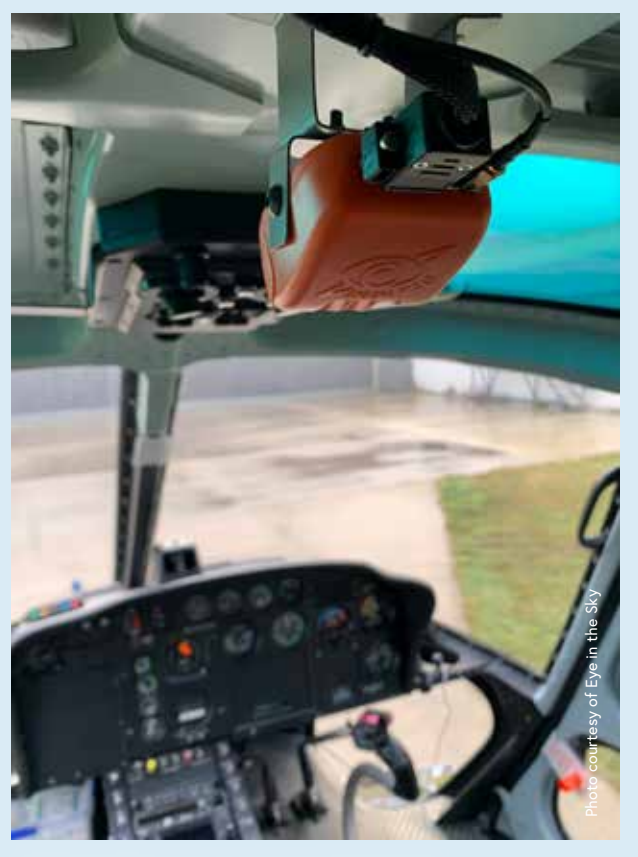
# FENZ and DOC will now only use aircraft equipped with cockpit recorders, to transport their staff.

"In the meantime, we'll obviously be making use of aircraft that are already equipped."