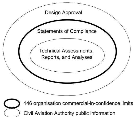
Figure 1. Proprietary Information

Any submission to the CAA for approval is treated in a similar manner and the approval itself is the only document generally available.