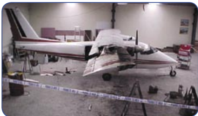
The aircraft was extensively damaged by explosion and fire.

He proceeded to pour 10 to 12 litres of fuel into the tank when a huge explosion occurred inside the tank, blowing the top and the bottom out of the tank and the wing. A fireball erupted in both directions and the explosion blew the engineer off the ladder. He fell into the fire now burning on the floor. The fireball severely damaged the 6 metre high roofline and 75 square metres of roofing had to be replaced.