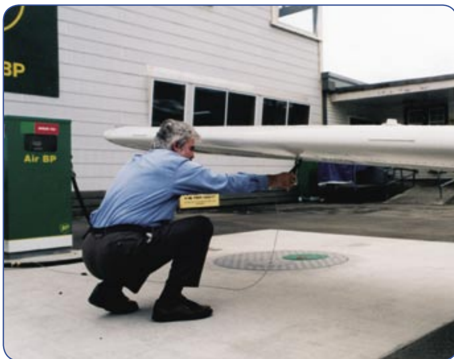
Attaching the bonding lead is the first action when refuelling, and removing it the last.

All pilots will be familiar with the routine bonding when an aircraft is refuelled at the pumps – the bonding cable is reeled out and attached to a convenient metal part of the aircraft. When refuelling from drums, always ensure there is a bonding lead connected to both the aircraft and the drum in use. Make the necessary connections before removing any fuel caps. Additionally, it is safe practice to keep the fuelling nozzle in physical contact with the filler orifice at any time fuel is being pumped.