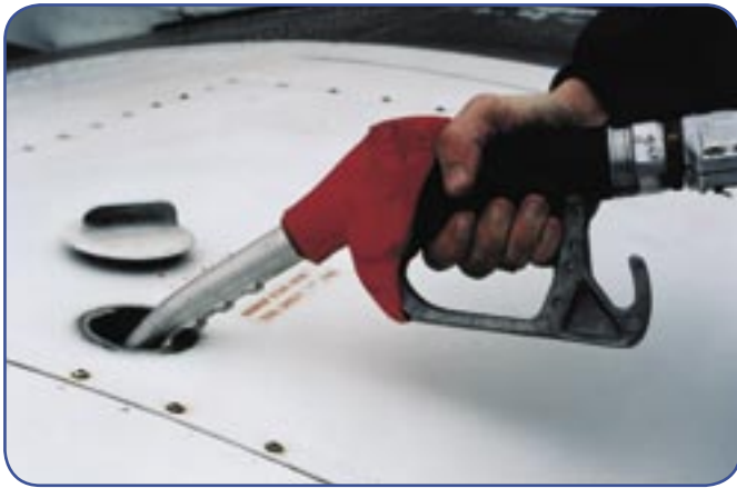
Keep nozzle in contact with orifice while fuel is flowing.

This also applies to the filling of portable containers – place the container on the ground, and maintain contact between the fuel nozzle and the container. Approved containers (these comply with Australian and New Zealand Standard 2906:2001) have this instruction on the label.