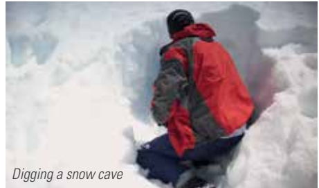
Digging a snow cave

The second shelter option is required if you have damaged the aircraft to such a