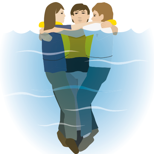
Huddle and hold

If you are on your own, then the technique is to huddle up with yourself, cross your legs and pull your knees up towards your chest. Keep your arms against your sides and folded in front of you. The big heat loss areas are your head, so keep it out of the water, your armpits, so keep your arms at your side, and your groin so keep your legs folded.