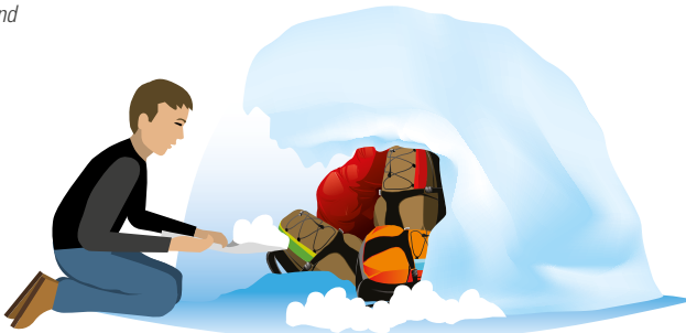
Making a snow mound

hours at least. In the meantime you are getting wet and cold in your cotton shirt and pants, and everyone else is just plain getting cold. Realistically, the snow mound or snow cave option, while it can provide the warmest shelter, will probably make you hypothermic once you stop digging and remain wet in your cotton clothing. You will burn up a lot of energy digging, which you would have been better using to keep warm and dry by some other means. So this option is the last resort, and even then, only if you are prepared for it and the snow is favourable.