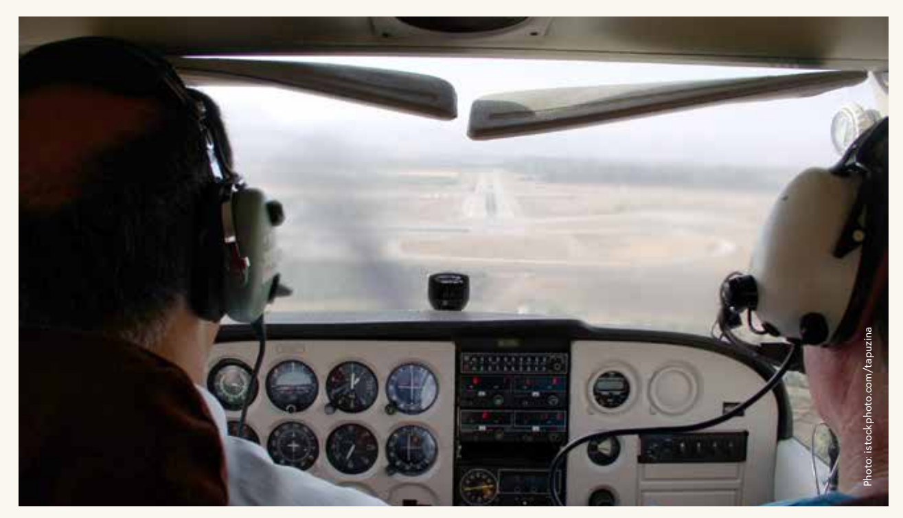
// "In an emergency, clear and timely communications help get the quickest and most appropriate response." Plane Talking, p5.

The unfortunate pilot would then be faced with the choice of a deadstick forced landing, or a parachute jump over the side, neither of which was particularly desirable.